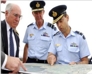
Bungendore Defence Centre

Leighton contractors selected Stowe Australia as their exclusive electrical partner