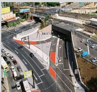
INB – Inner Northern Busway

Stowe Australia actively worked with the alliance to develop and implement design innovations to improve the overall constructability of the project