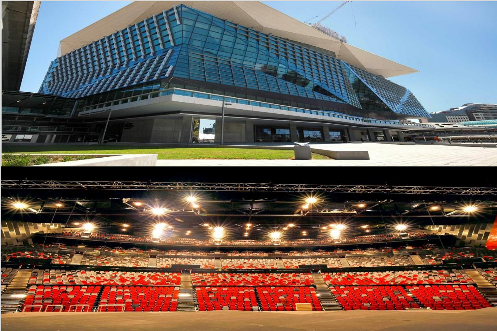
Sydney International Convention Centre